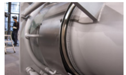
The raised bellows are provided with an outer protective cover prior to transportation