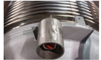
Leak monitoring with sheath tube integrated in the bellows