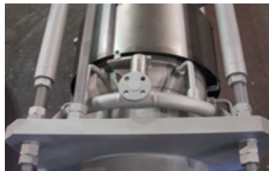
Ring line from above with connecting piece for blowing in steam as barrier aflow