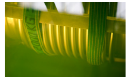
Pressure and leakproof testing in special liquid bath