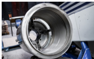
Preparation for welding the external protective cover