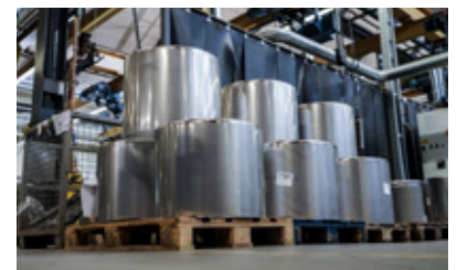
After all tests, monitorings and checks during production, the construction elements are washed with 100% chemically pure water before they are shrink-wrapped in halogenide-free film