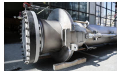
Axially adjustable anchorage