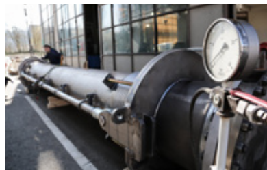
TÜV- monitored pressure test of the 7-metre long component at 28 bar