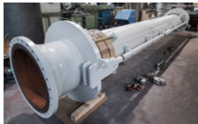
A multi-layer external epoxy coating to provide corrosion protection